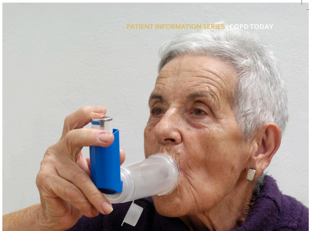
Adding a spacer may make it easier to use an inhaler for controlling COPD.

Another way to take an inhaled medication is with a nebulizer, a device that converts liquid medicine into a fine mist that is inhaled using a mouthpiece or mask. A nebulizer is particularly effective for the elderly or someone experiencing severe breathing problems. If you do use a nebulizer, make sure you know how to keep