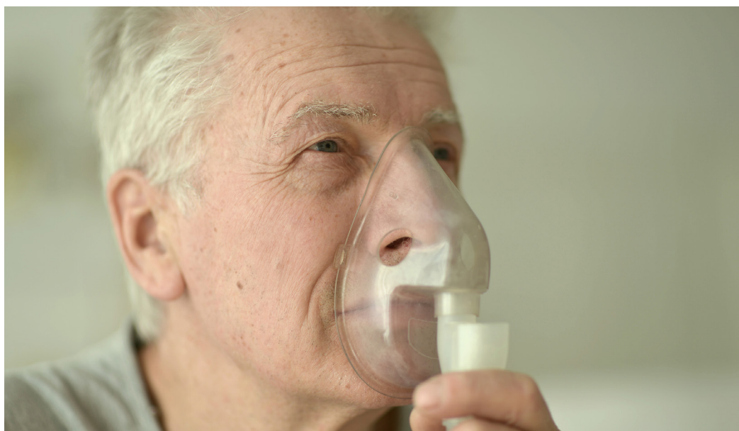
A nebulizer is particularly effective for the elderly or someone experiencing severe breathing problems.

Because being diagnosed with COPD is stressful, you also may be referred to mental health specialists who treat depression and anxiety and also can provide counseling for family members. These mental health specialists can include psychiatrists, psychologists, and social workers.